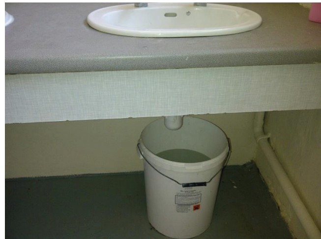
Ladies toilets at the lido. Unclean & with buckets of water to catch leaking drips from unmaintained sinks/toilets.