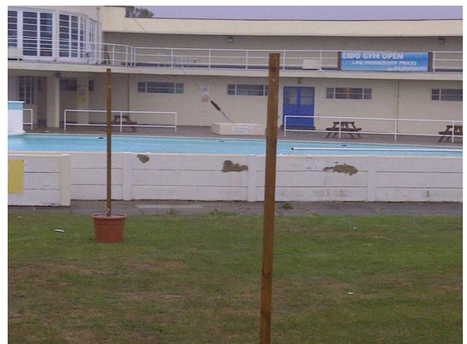
Summer Season 2011 – ‘Volley Ball Facility’ Two Plant Pots with sticks of wood in. This is allegedly the extent of the investment plan by the leaseholder.