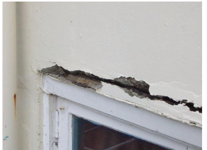
Cracks to exterior of building since disguised with paint.