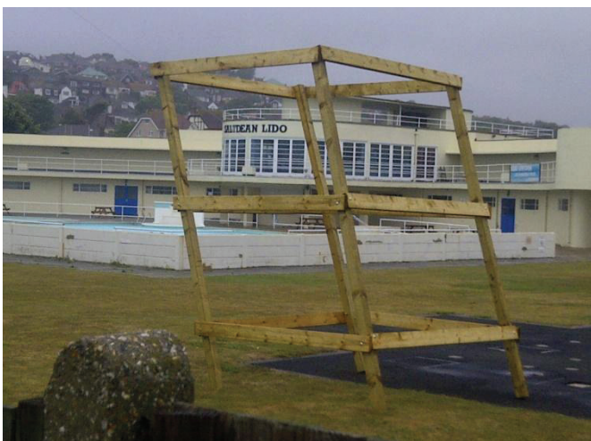
Summer Season 2011 – ‘climbing frame’ , 1 st attempt, This collapsed, it was reported to B&H CC Environmental Services Department who did not take enforcement action. There were no children’s play facilities available again this season.