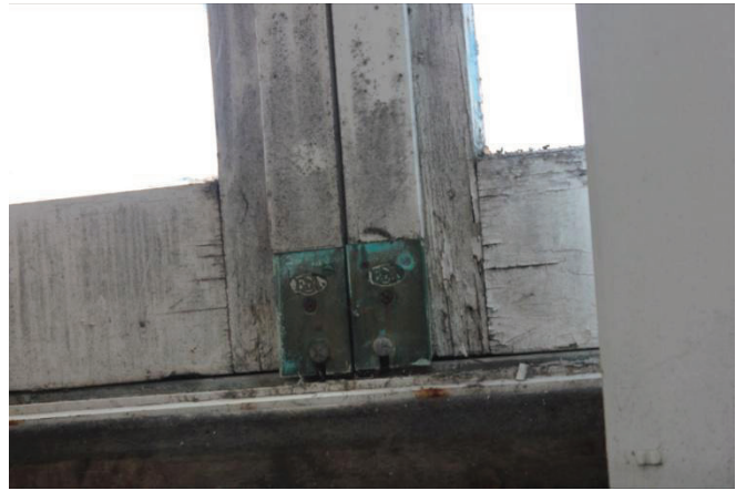
Main rotunda doors showing rotten wood & damp from water damage.