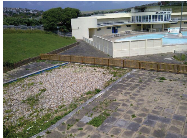
Paddling pool filled with gravel and fenced off.