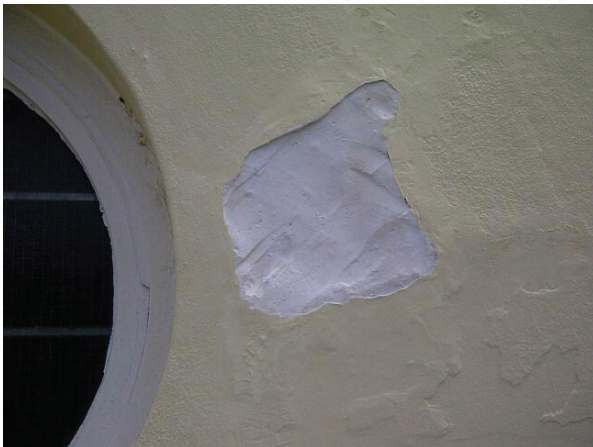
Plaster & paint falling off the building again.