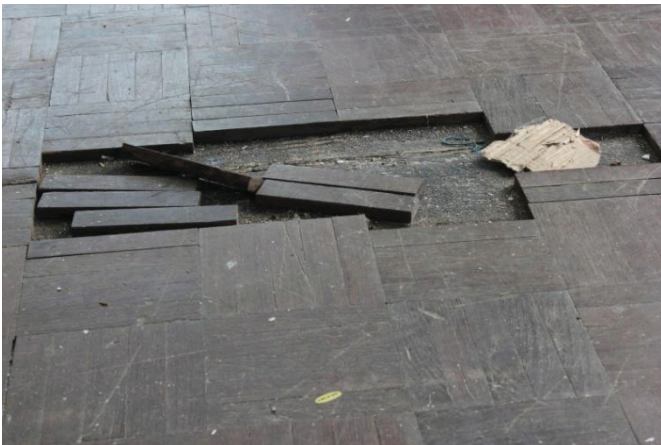
Original flooring damaged/broken/missing throughout.