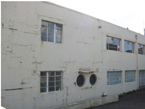
Rear sections to the lido building containing the library and community centre. Note cracks, rotten window frames and disrepair across the entire building, now simply painted over!