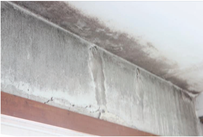
Damp, mould & water staining to interior of Rotunda.